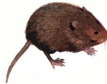
Water Voles (Y4)